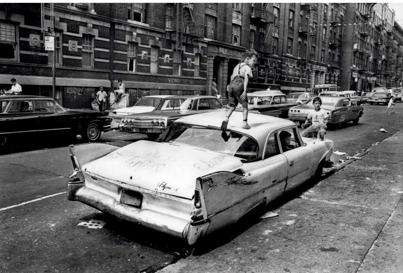
On Fox Street in the Bronx, an abandoned Plymouth Savoy becomes a jungle gym for kids to play on in the summer of 1966.