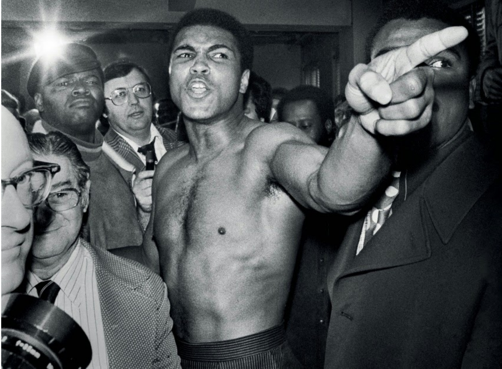
Muhammad Ali finger-pointing during the weigh-in before his second boxing match with Joe Frazier on 23 January, 1974, in New York. Ali won the fight and regained the title.