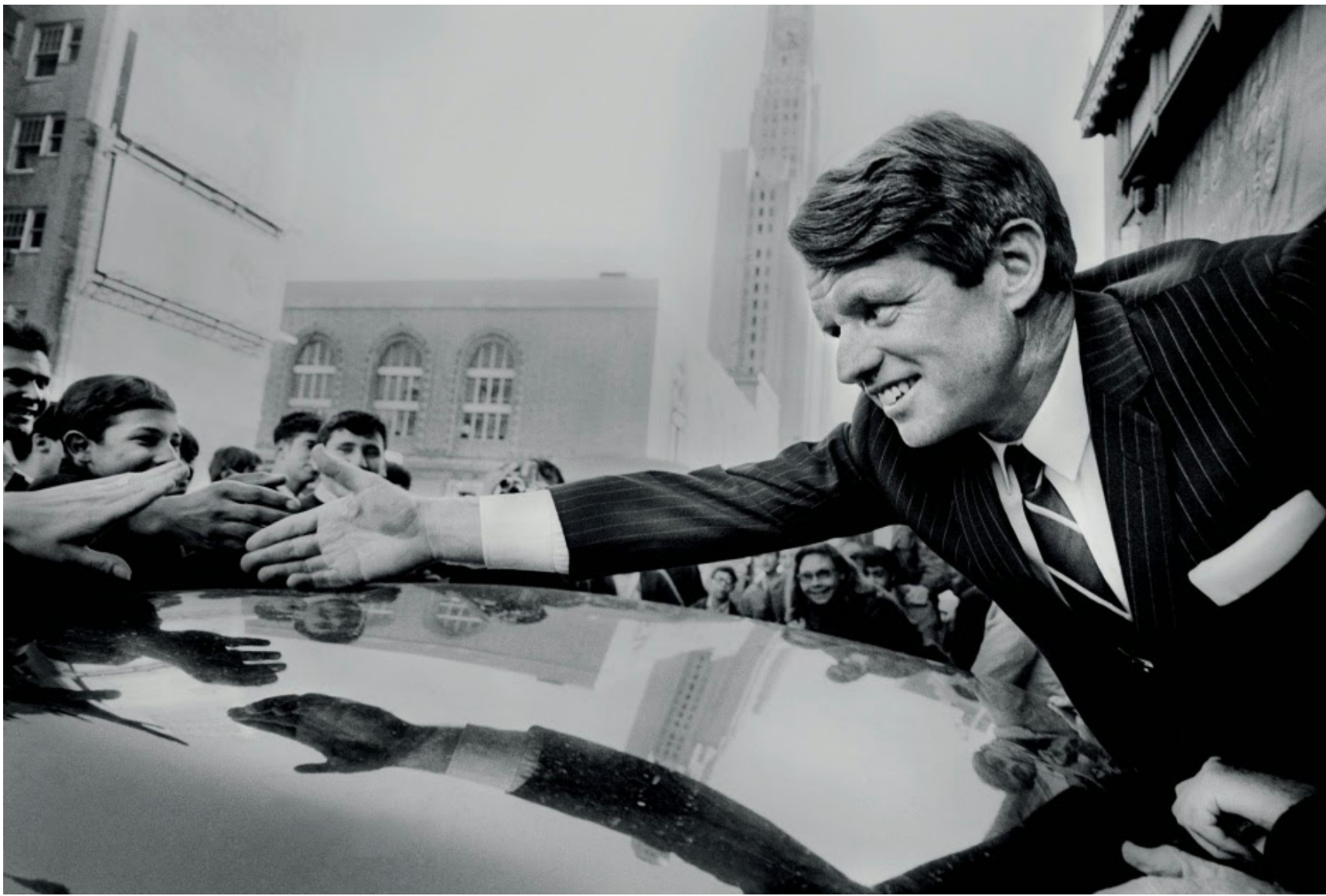
Presidential candidate and New York senator Robert Kennedy greets supporters on a campaign stop in Fort Greene, Brooklyn on 1 April, 1968.