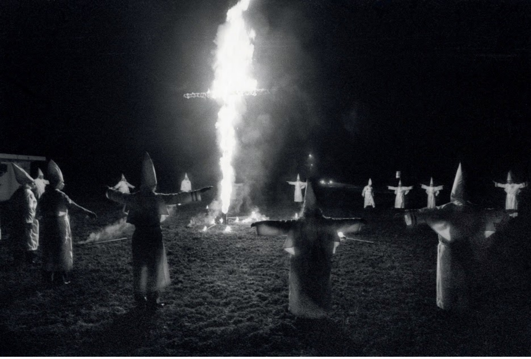
A Ku Klux Klan meeting in Dunham Springs, LA, December 1976.