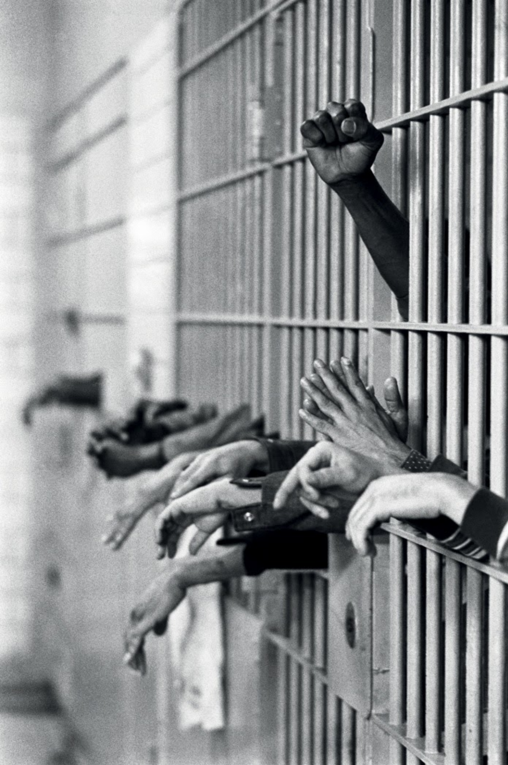
A fist raised in protest from behind the bars at Toms Prison, Manhattan, on 28 September, 1972.