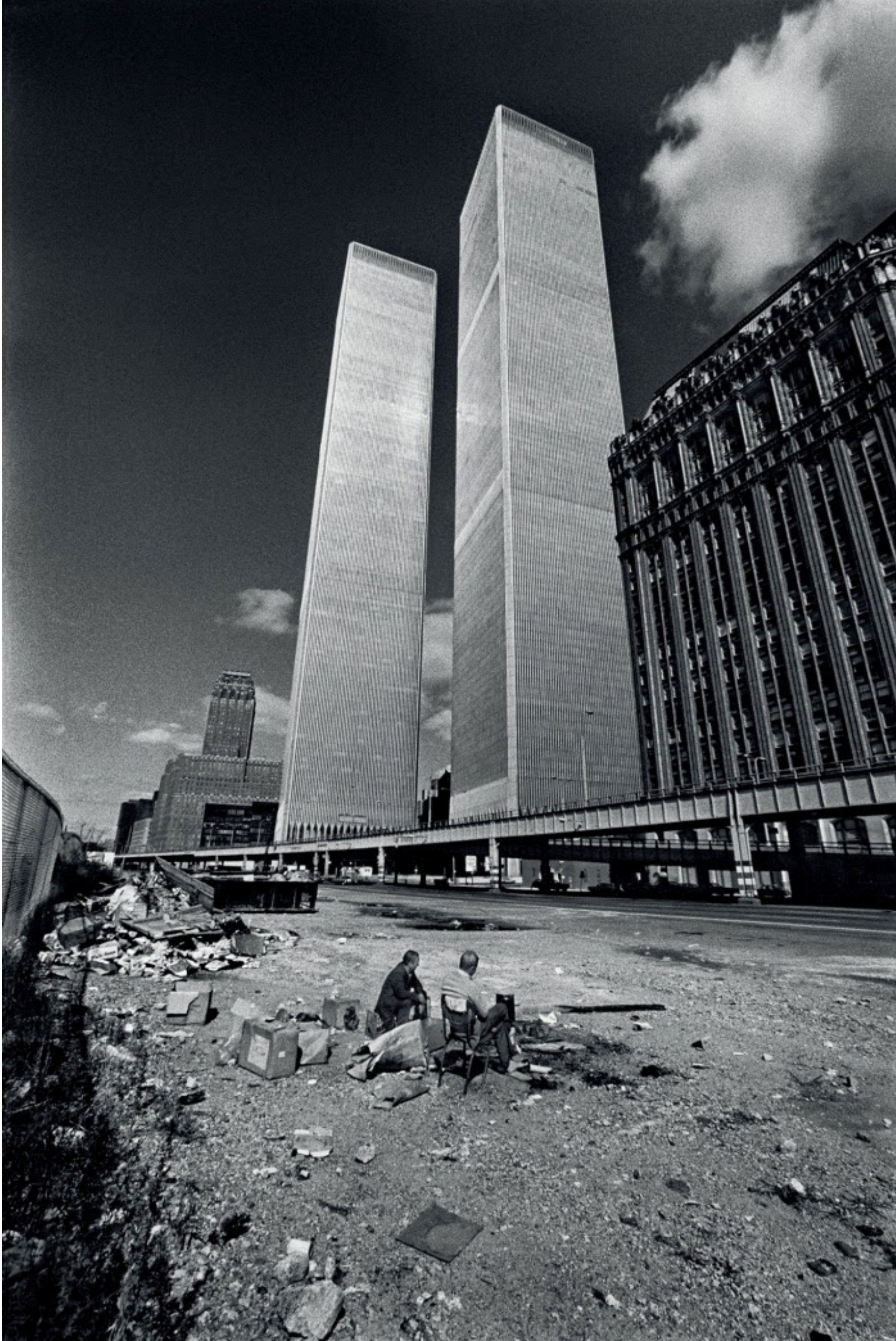
Two homeless men squat in the shadow of the recently completed World Trade Center in October, 1975. New York City was on the verge of bankruptcy and the World Trade Center sat largely vacant.