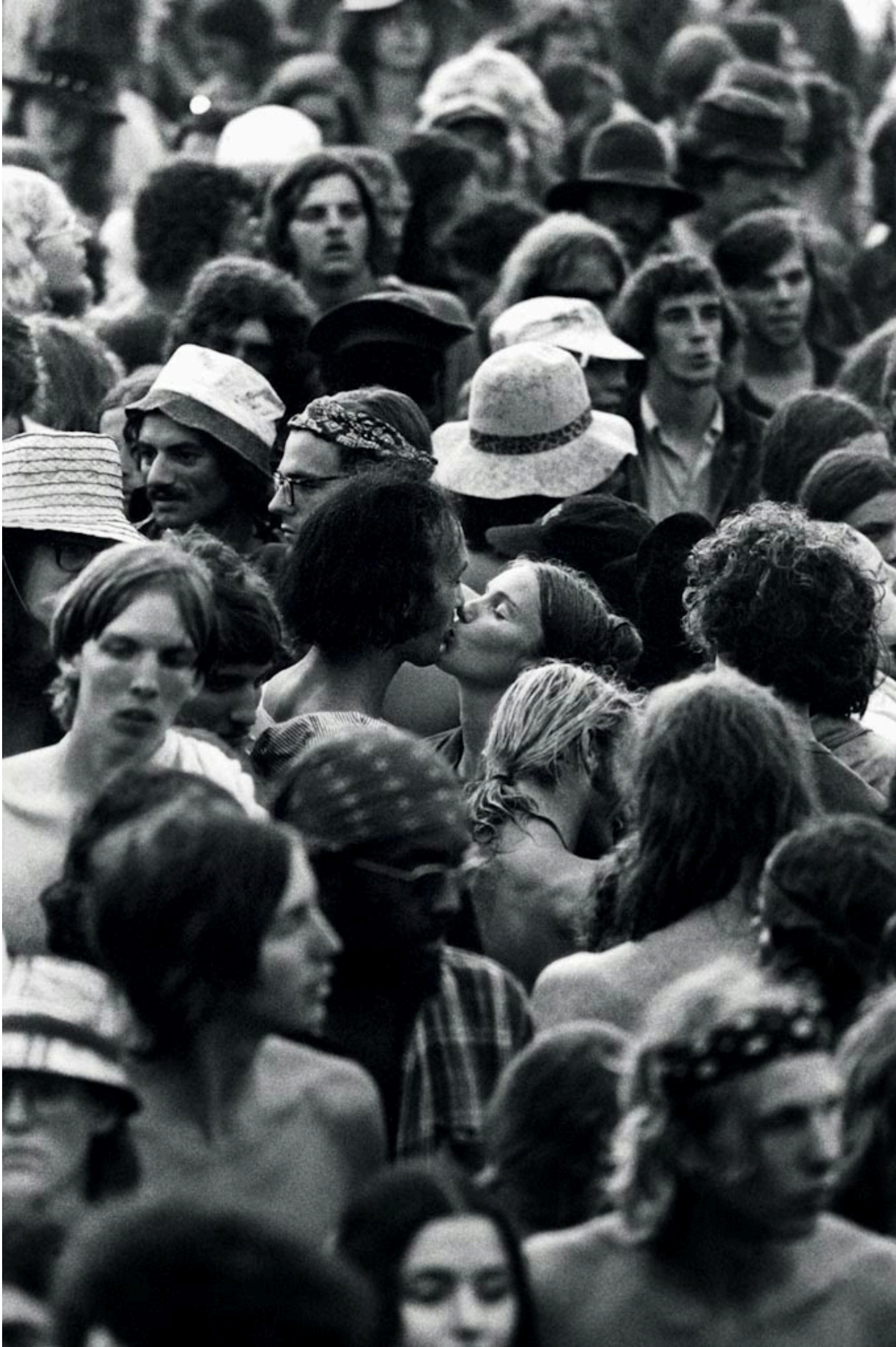
A young couple kisses as the chaos of the crowd whirs around them with an estimated 600,000 rock fans on July 28, 1973. The Summer Jam at Watkins Glen was a 1973 rock festival which once received the Guinness Book of World Records entry for "Largest audience at a pop festival."