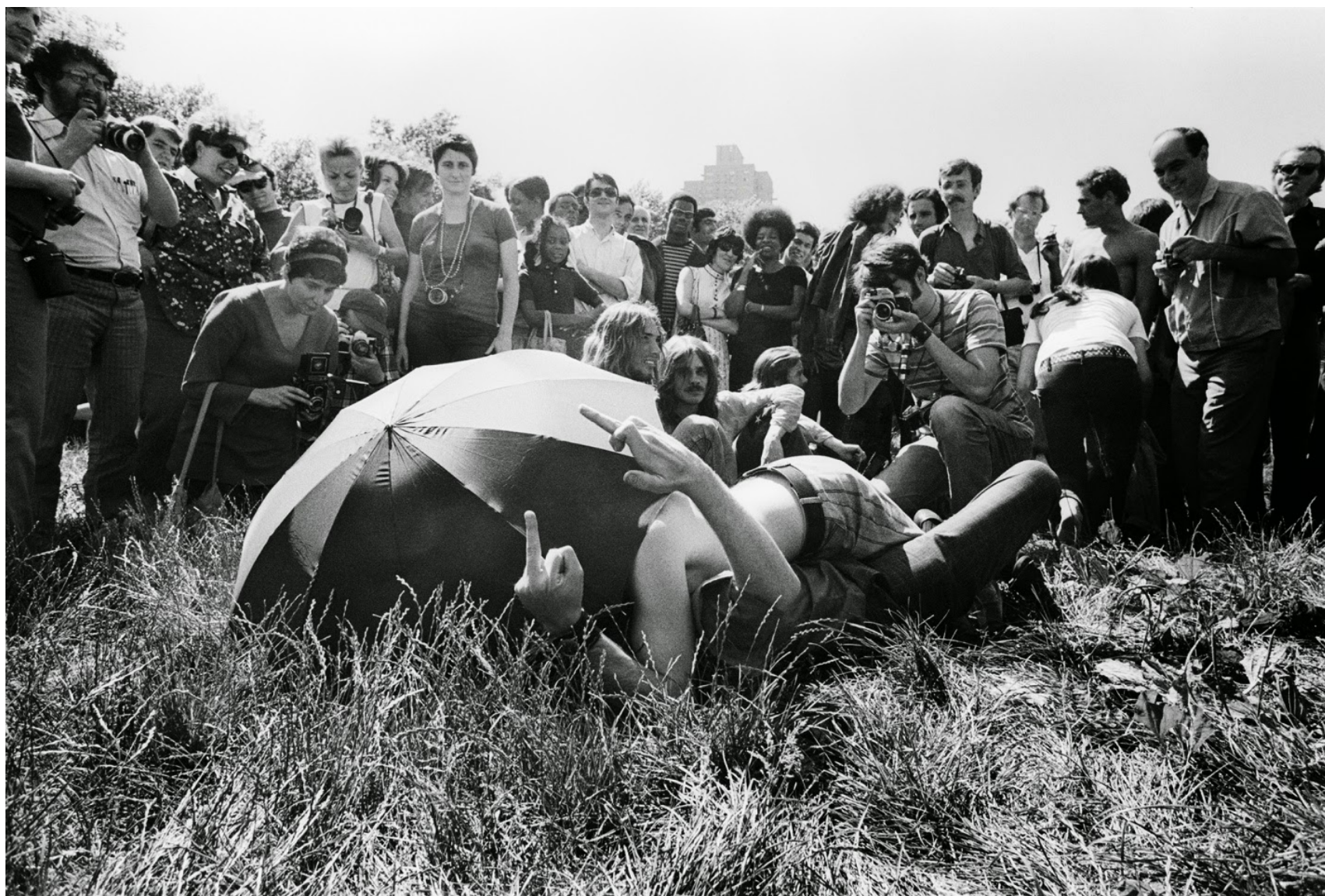
Two men 'flip the bird' at the Central Park crowd that's formed as they compete in the kissing contest during New York's inaugural Gay Pride celebration on 28 June 1970.